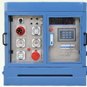
Energy Storage System